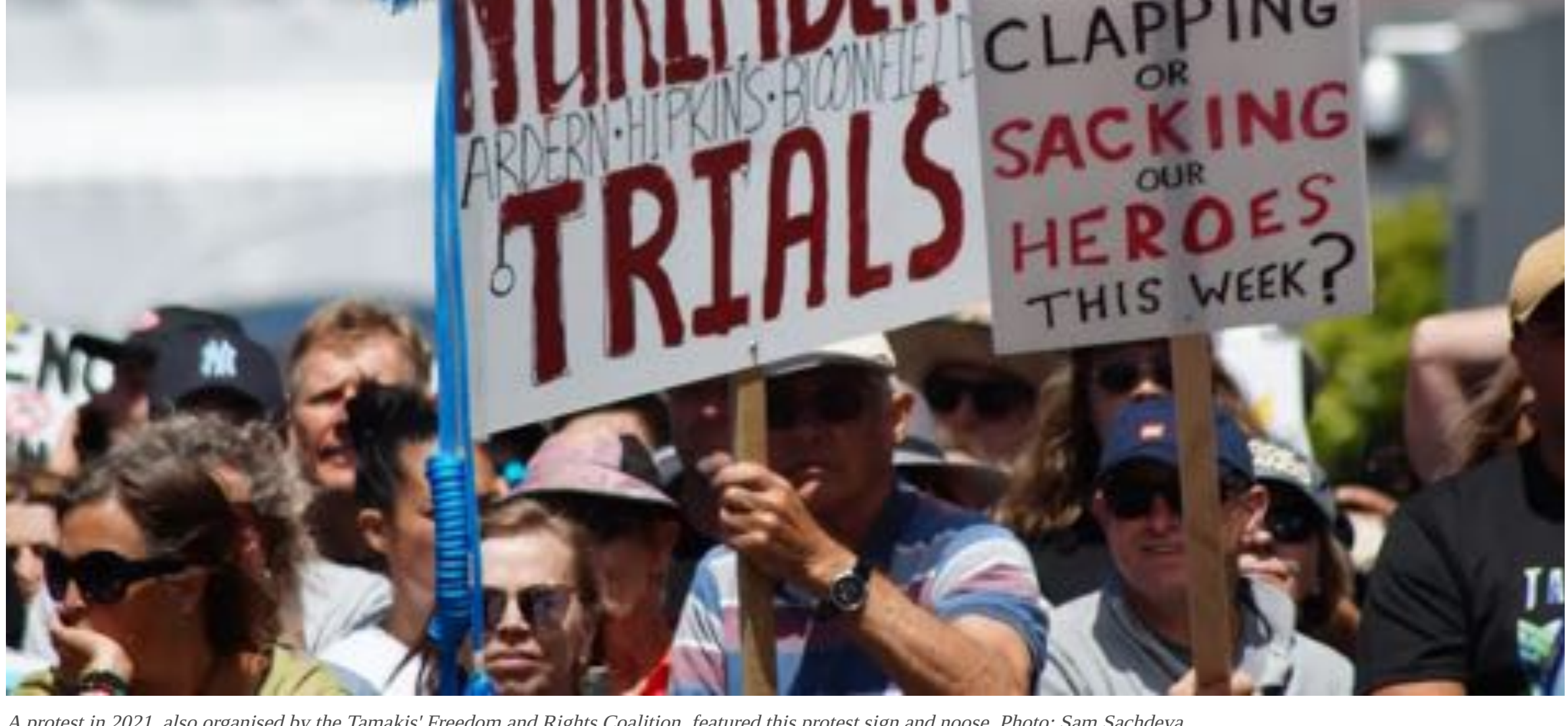
A protest in 2021, also organised by the Tamaki's Freedom and Rights Coalition, featured this protest sign and noose.